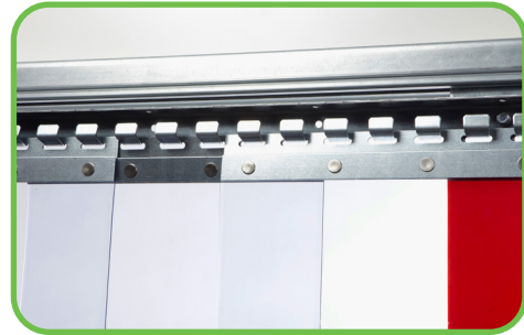
Fig. 2: Strip curtain Type EH