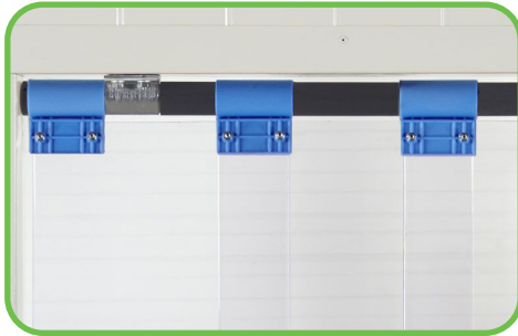
Fig. 1: Strip curtain Type SE